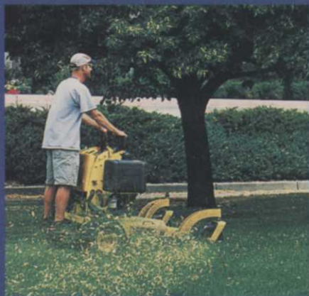
Flat ground is hard to find on Roche of Colorado Corporation's site, which is why most mowing is done with stand-on mowers.

Where bluegrass has had trouble surviving, Ned's crews have added flower beds with California poppies, snapdragons, Brazilian verbena, begonia, lobelia,