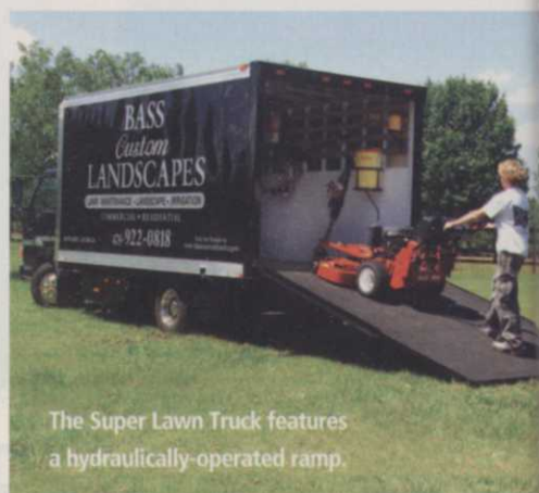
The Super Lawn Truck features a hydraulically-operated ramp.

to drive right into the back of the truck for easy transport