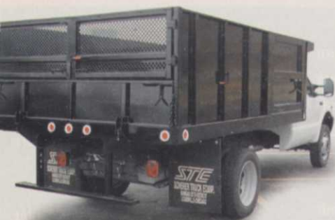
▲ Omaha Standard's Landscaper Truck Body