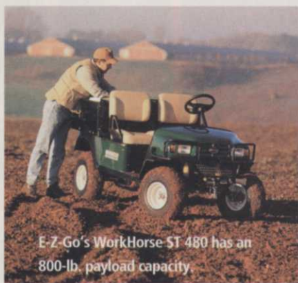
E-Z-Go's WorkHorse ST 480 has an 800-lb. payload capacity

► Reading Body's contractor body and equipment carrier in one