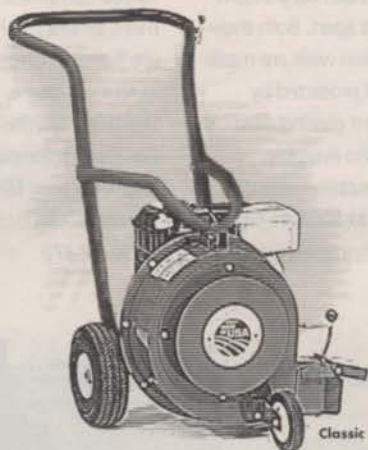
Classic Leaf Blower