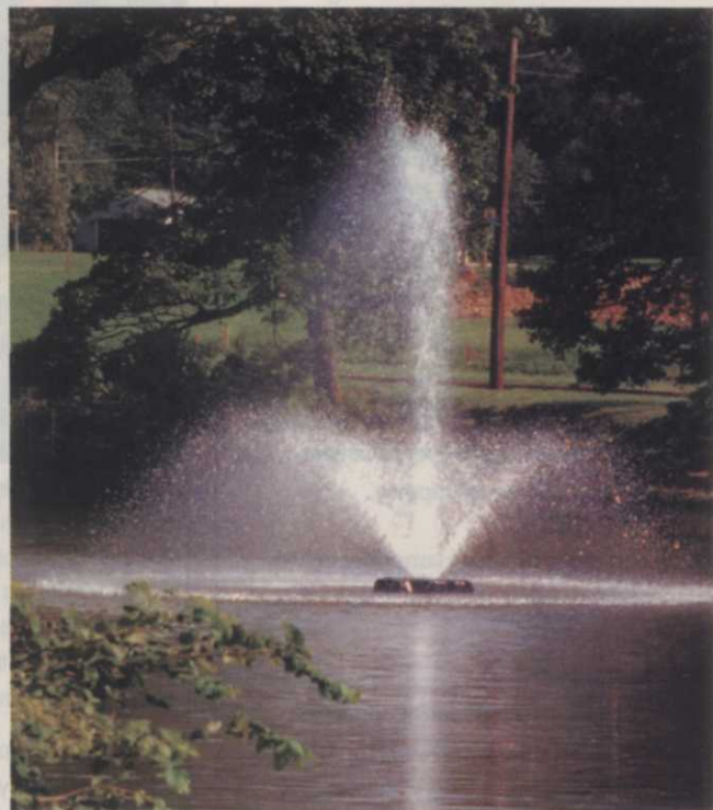
▲ Otterbine Barebo's Phoenix aerating fountain

One final tip is to avoid tinkering with the filter. "Taking the biological filter apart too often is like transplanting a tree every week. It destroys its efficiency," Wittstock says.