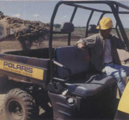
◀ Polaris Industries' utility task vehicle