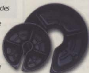
Tree Ring Jr.