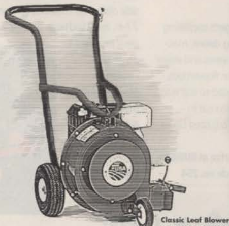
Classic Leaf Blower