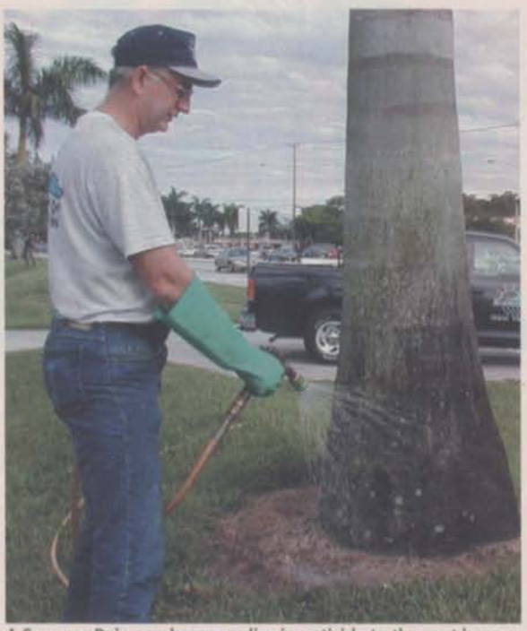
A Summer Rain employee applies insecticide to the root base of a royal palm tree.

"First, it can be applied to the root zone