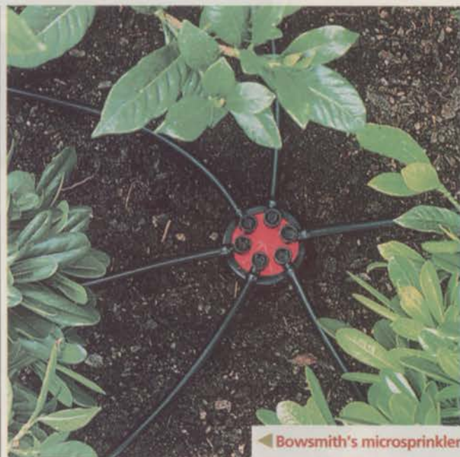
◀ Bowsmith's microsprinkler