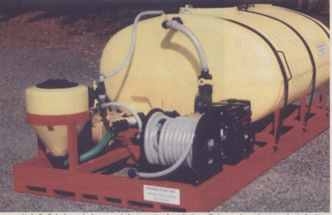
HydroTurf's hydroseeder has a new inductor system for agitation, offering an alternative to mechanical agitation. Various models on the market accommodate large and small seeding jobs.

continued from page 61 dromulching can also be the difference between success and failure on any sloped or nonirrigated field. "In addition to the seed being wet, that extra bit of moisture can be the difference between success and failure," Gaussoin says.