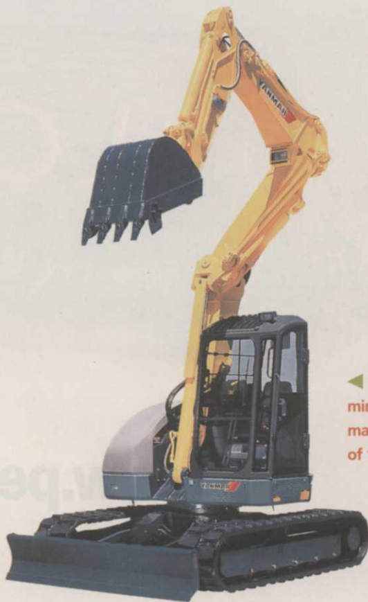
◀ Yanmar's mini-excavator has a maximum dig depth of 14 ft., 3 in.

log shear attachment has a new universal mounting system that allows it to be adapted to any excavator. Adding the Megabyte now only requires that a bushing be inserted in the linkage arm. Made by Smoracy, LLC and marketed by Bandit, Remus, MI, it pulls