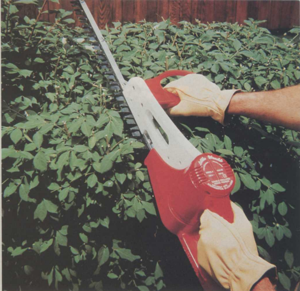
Little Wonder's hedge trimmers feature reduced weight and increased blade speed.

Safety/training: "All Little Wonder equipment is submitted to multiple European safety standard companies for review. Our goal is to meet or surpass all European safety