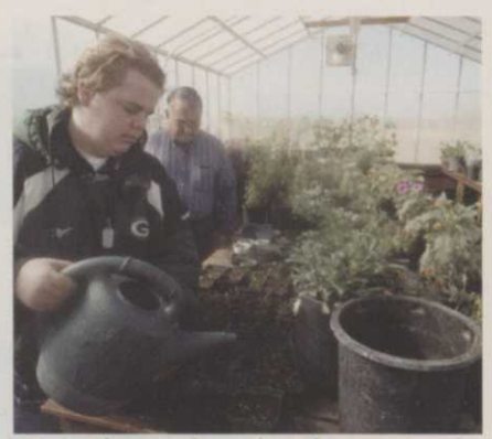
Boys at the greenhouse learn how to properly care for plants.

Through the Colorado Boys Ranch, young men are not only learning more about themselves but learning a trade. Some are being taught how to operate the ranch's big