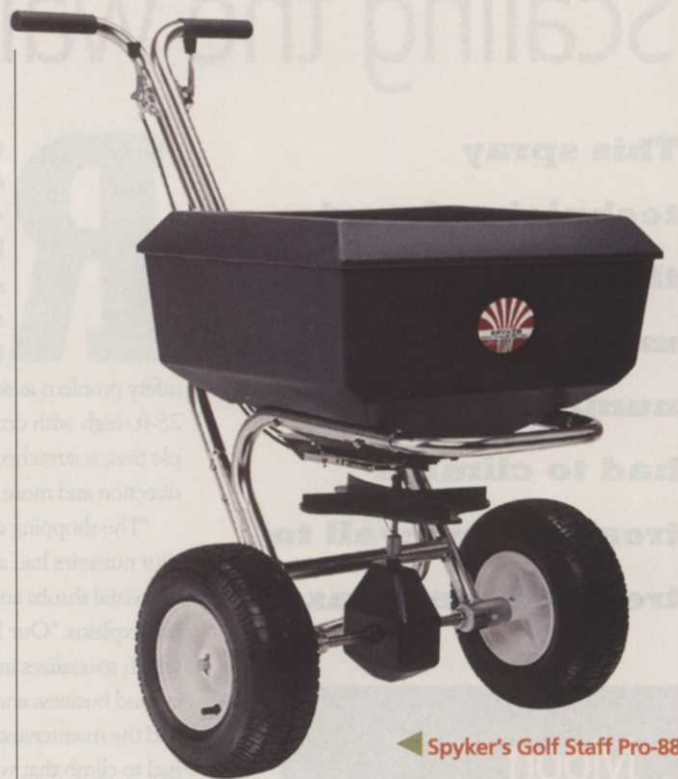
◀ Spyker's Golf Staff Pro-88

"For general grounds maintenance, we use it to dispose of grass clippings, leaves and pine needles. Instead of making large piles, we disperse them in fringe areas so they'll decompose faster. We've even used it to spread de-icing materials in the winter," he says.