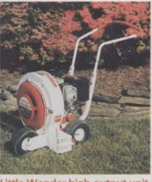
Little Wonder high-output unit