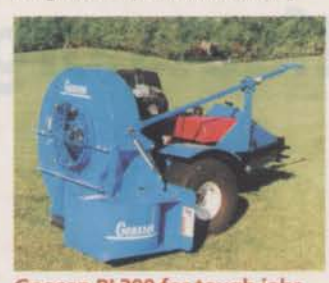
Goosen BL300 for tough jobs

The Goosen self-propelled BL3000 debris blower's 27-in. blower fan delivers a powerful thrust to tackle tough cleanups. Features sturdy