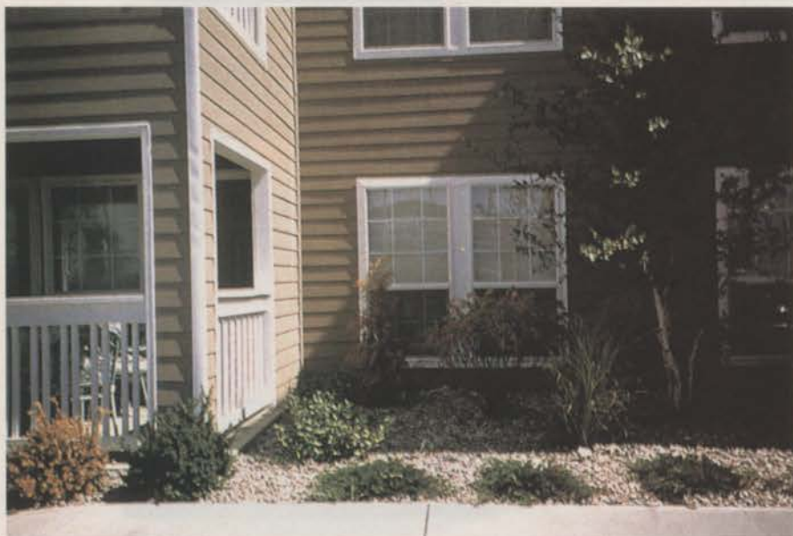
This is a bad location because of the hot, dry, rock mulch. Plus, the tree was planted too close to the sidewalk and the building.

The scale of the project may also influ-