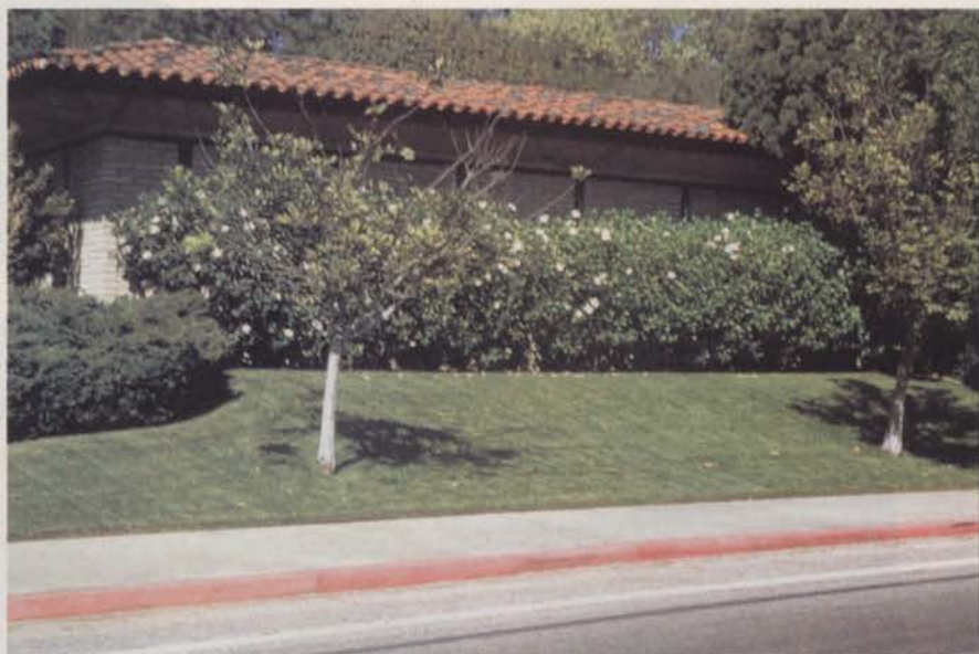
Turf and trees should be separated. Mulch will prevent weed growth, keep roots cool and hold soil moisture.

Spread the roots out laterally, especially with container or bare root stock. The goal is to mimic nature and encourage the roots to spread laterally. If roots have started circling in the container, carefully spread