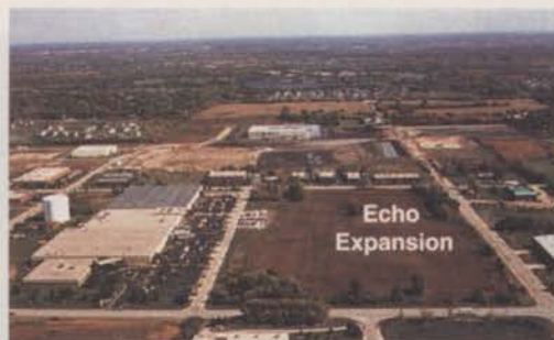
Echo Incorporated, Lake Zurich, Ill., facility.

Innovation has also been a critical component in helping the company become the dominant player in the hand-held lawn and garden equipment industry worldwide. Since