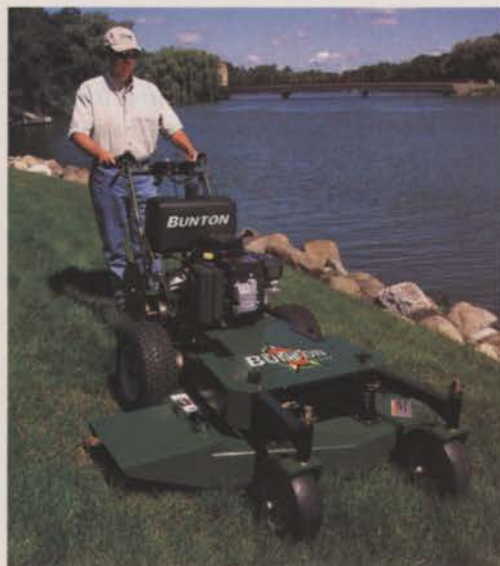
Bunton Gear Drive