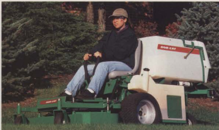
Bob-Cat ZT 100 Series