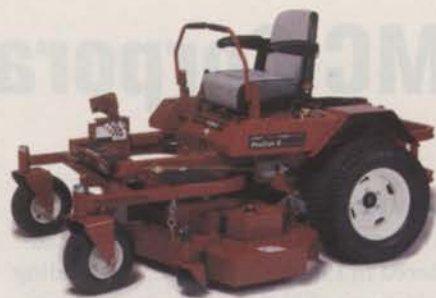
ProCut Z with IS®