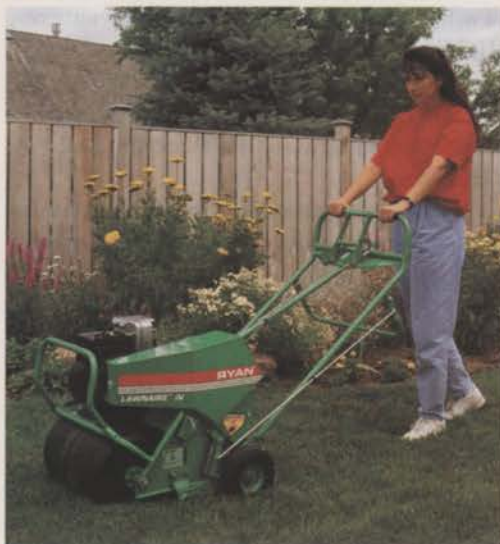
Ryan Lawnaire IV

Textron Golf & Turf manufactures a full range of vehicles and turf maintenance equipment for professional lawn care, golf, turf, sports field and industrial applications. The company offers multiple brands—specifically Bob-Cat® and Bunton® mowers and Ryan® lawn renovation equipment to meet the diverse needs of landscape contractors and lawn care professionals.