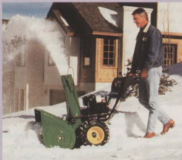
John Deere walk-behind snow blowers come in four new models.

John Deere's 2000/2001 walk-behind snow blowers come in four new dual-stage models including the 924DE, 1128DE, 1128DDE and the 1332DDE. They include a Tecumseh OHV