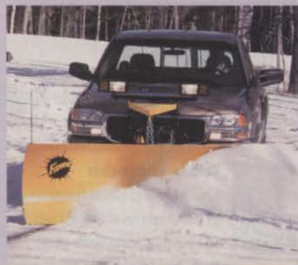
Fisher blades built with heavy 11-gauge steel

Rugged HD series plows from Fisher Engineering are the choice of the plowing professional. These 8-, 8 1/2- and 9-ft. plows are designed for 3/4 and 1-ton four-wheel drive trucks, as well as 15,000 GWW "Super Duty" vehicles. Plow blades are 29-in. high and built with heavy 11-gauge steel. Only the edge of the