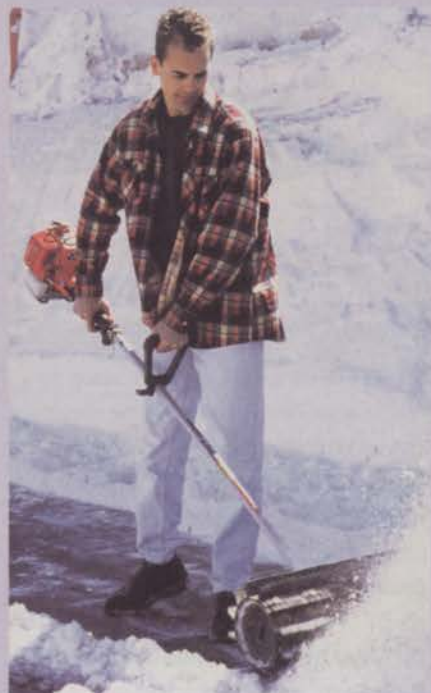
Shindaiwa PowerBroom is handy for sidewalks.

shovels or large snow removal equipment. The design of the gear case, combined with the broom engine's all-position carburetor, allows the unit to be used upside down. It's lightweight, balanced and powerful. For more information, contact Shindaiwa at 503/692-4606.