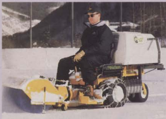
Walker Manufacturing's broom attachment in action

Walker Manufacturing Company's 47-in. rotary broom implement is an available attachment for the Walker mower tractor. The five-position angle head sweeps debris (and light snow) from hard surfaces and also works well for detatching and raking. The broom is quickly