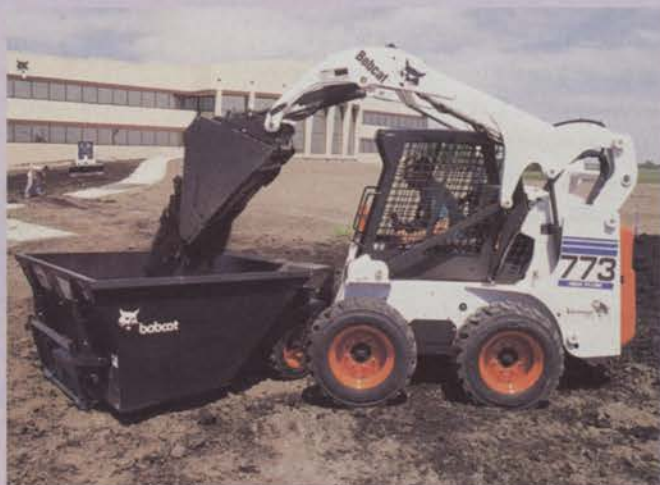
Bobcat dumping hopper

The Shindaiwa PowerBroom is a gasoline-powered sweeper attached to an aluminum shaft, like those on a hand-held grass trimmer, edger or brushcutter. Rotating sweeper drum has 12 rubber-like fins that sweep snow off walkways and other surfaces with ease. No need for