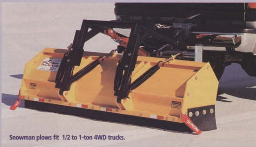
Snowman plows fit 1/2 to 1-ton 4WD trucks.

Snowman Snowplow's 70+SC and 80+SC models (7- and 8-ft. single cylinder) plows are designed for use with 1/2 to 1-ton four-wheel drive trucks. Add extension wings to the 70+SC to increase blade width to 8 1/2-in. for high-volume jobs. All models have a baked-on powder coat finish or a hard slick finish. Moldboard height is 23 in. for larger capacity. No welding or special mounting equipment is required. For more information, contact Snowman at 888/766-6267 or visit www.snowmansnowplow.com