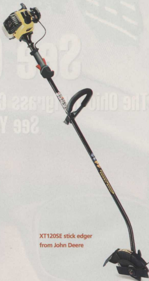
XT120SE stick edger from John Deere

Cut sod quickly and efficiently with the SC-18 from Bluebird, Denver, CO. The unit has the same 4-wheel drive power of the