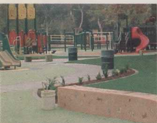
Children of all abilities can romp on this playground.

Talk about taking on a project that makes you feel good. Valley Crest, a division of Environmental Industries, Inc., knows what it's like after recently completing construction of "Shane's Inspiration: A Boundless Playground," a play environment designed to accom-