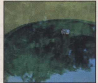
Ottershield Lake Dye