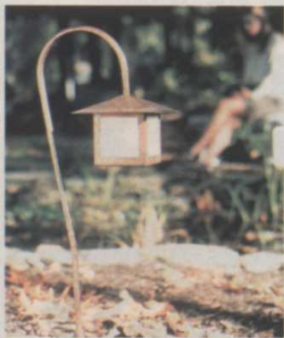
Architectural Landscape Lighting offers classic shapes.

The company also has canister-shaped outdoor downlights suitable for building lobbies, corridors, entryways, exterior building walls adjacent to gardens and parks and parking garages. The lights feature a classic cylindrical, canister-style housing with subtle architectural ring details in each of four models. The smooth outer surface has no