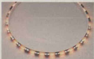
Ardee low-voltage strip lights

Clikstrip for Damp Locations is flexible, low-voltage, high performance linear strip lighting de-