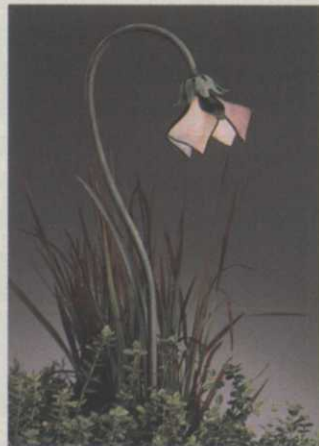
Hadco's hand-crafted look

The Garden Art Collection from Hadco, Littlestown, PA, offers the look of hand-crafted, solid copper