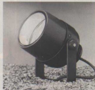
Kichler offers a complete line.

An entire range of lighting products, from ballard stakes to accent lights is available from Kichler Lighting, Cleveland, OH. The floating pond light is made of composite resin and is great for directing light