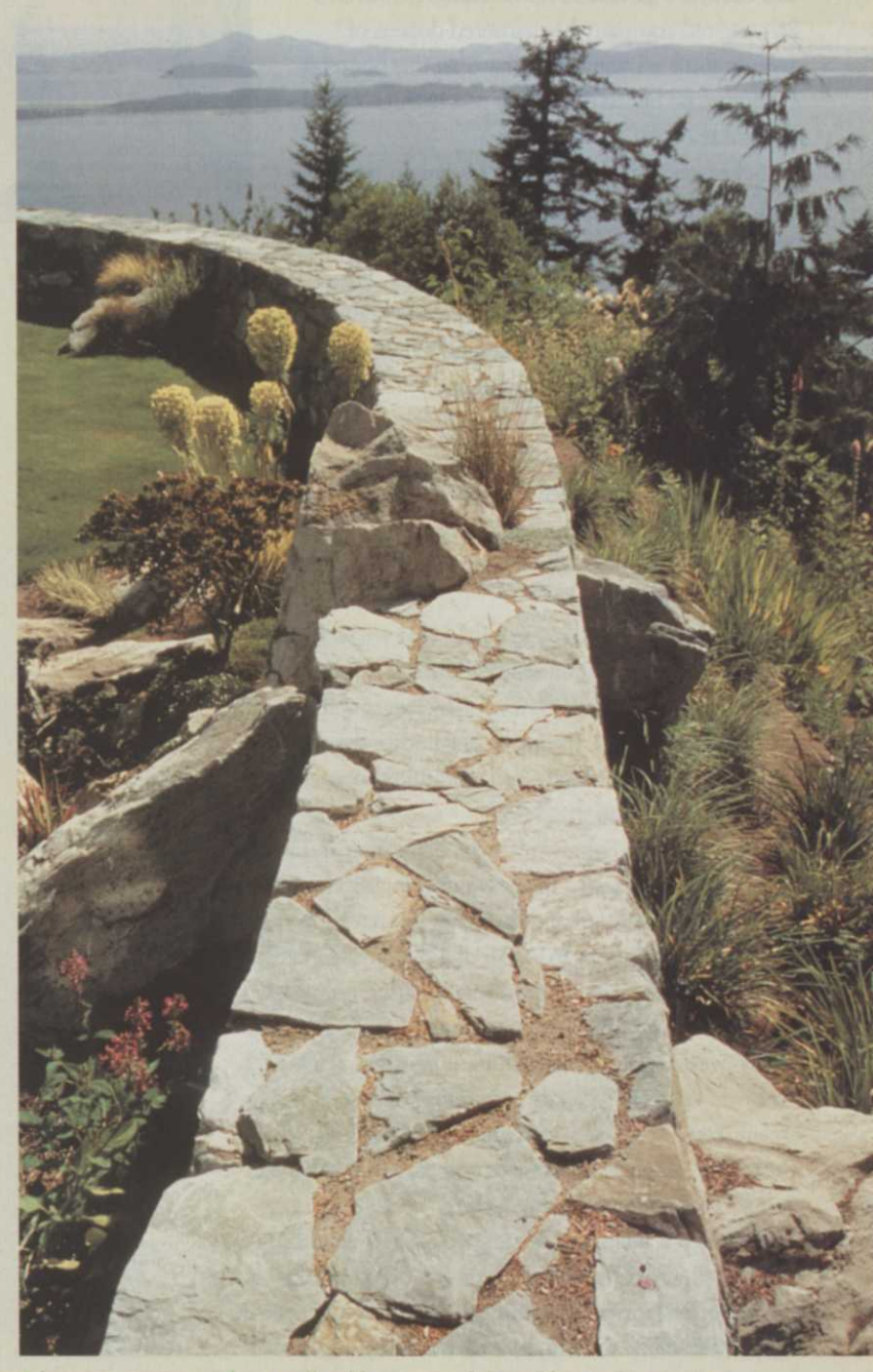
Schraven constructed these walls with stone wedging without using mortar.