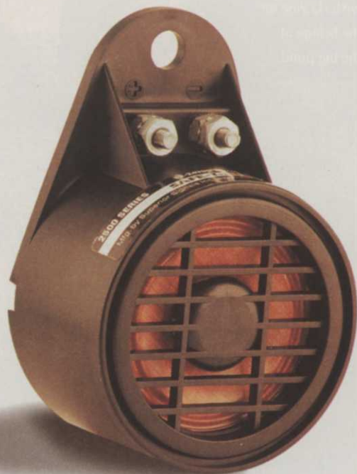
Superior Signals' new safety back-up alarm