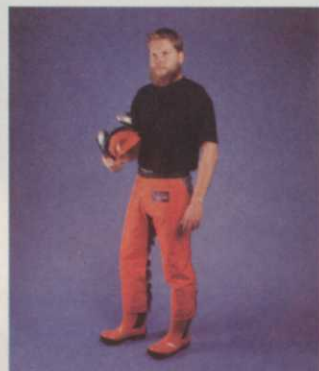
ProChaps' lightweight chaps

ProChaps chain saw chaps from Elvex, Bethel, CT, have Polar protective pads that are designed to