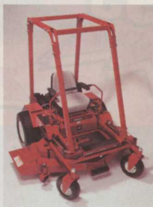
Ferris Industries' roll-over protection system

The new 4-pt. roll-over protection system (ROPS) for the Pro-Cut Z from Ferris Industries, Munsville, NY, offers better