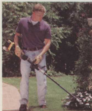
John Deere safety goggles

Dress for success with safety accessories from John Deere's Commercial Division, Raleigh, NC. Full line of footwear includes PVC or latex boot covers and rubber slush