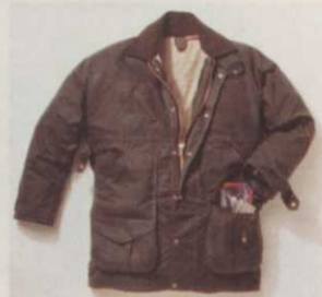
Filson's coat is saturated in paraffin to resist wind and rain

The new Foul Weather Coat from Filson's, Seattle, WA, will keep workers dry and protected. Its cloth is 100% tightly woven cot-