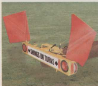
General Machine's high visibility Pole Trailer Light Kit

The Pole Trailer Light Kit from General Machine, Trevese, PA is a D.O.T.-approved system for improving visibility of trailers and