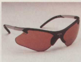
Direct Safety Co.'s hip glasses offer peripheral protection

Code 4 glasses from Direct Safety Co., Tempe, AZ, provide excellent