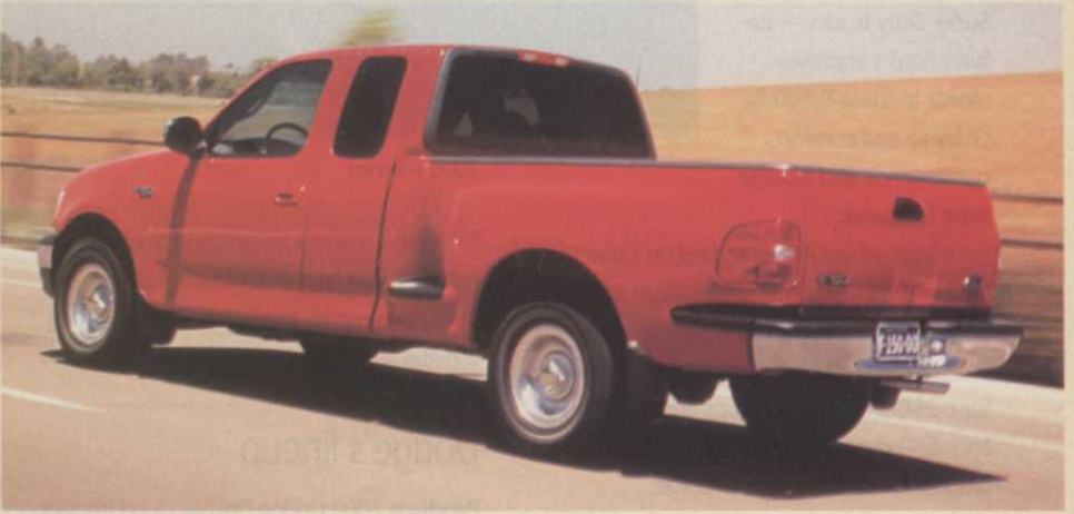
Ford F series