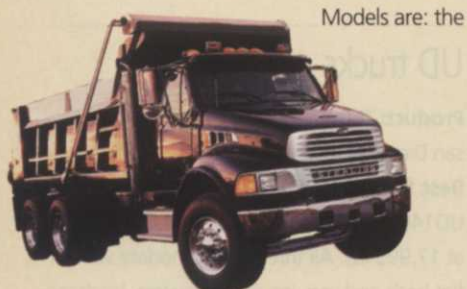
Sterling medium-duty trucks

· Available in four different models, covering each of the weight classes from Class 5 to mid-range Class. Can be customized to fit customers' needs.