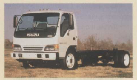
NQR is available in four wheelbase choices

Gross axle ratings range from 6,830 lbs. in the front and 14,550 lbs. in the rear.