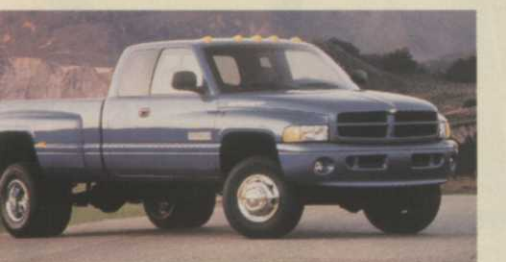
Dodge Ram Quad