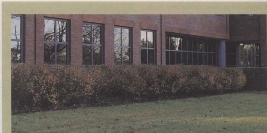
Because these shrubs hide interesting window sill detailing, they should be removed and replaced with shorter shrubs or ornamental grasses.

Nothing dates a landscape like foundation plantings, especially those of evergreen