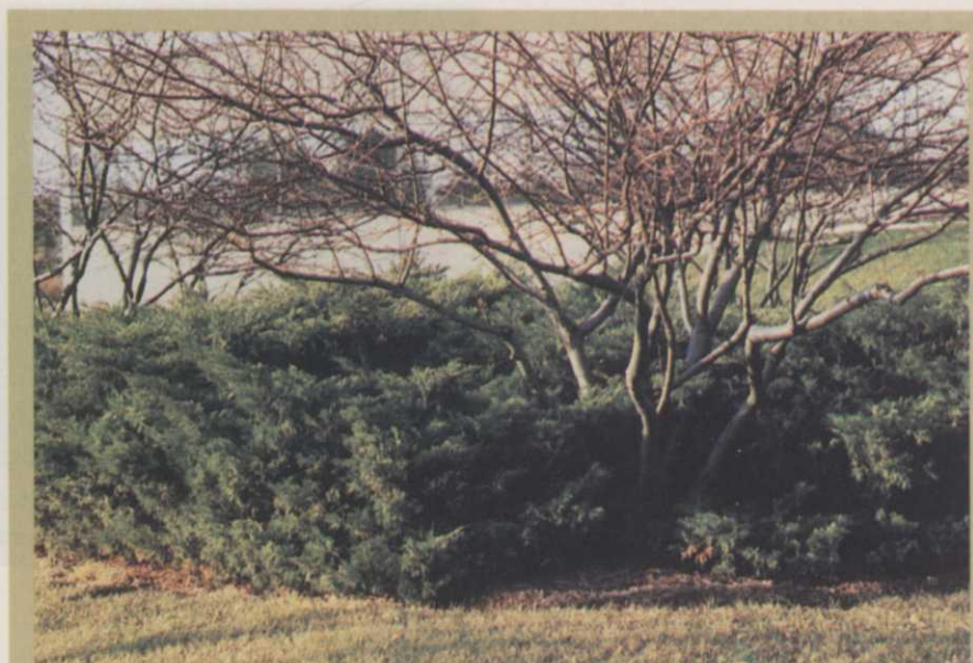
Overgrown shrubs obscure the multiple trunks of these crabapples. A band of Happy Returns daylilies winding in gentle curves within this bed would be a nice, low replacement and would add texture and seasonal color.

Who hasn't seen shrubs that have been repeatedly sheared into unattractive balls to maintain their size? They seriously date a property. Sometimes, shrubs can be renovated by drastic hand pruning, but often