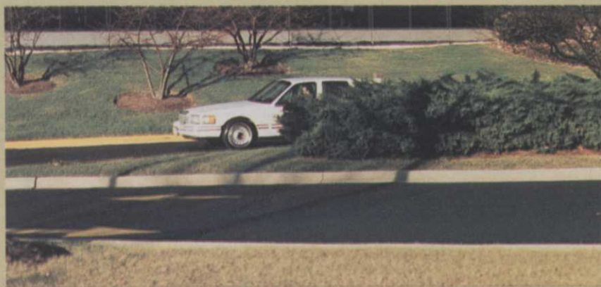
These overgrown junipers obstruct visibility and are dangerous. Lower shrubs would be safer and would be just as attractive in this location.

Most shrub species need to be replaced every 10 to 15 years because, unlike trees