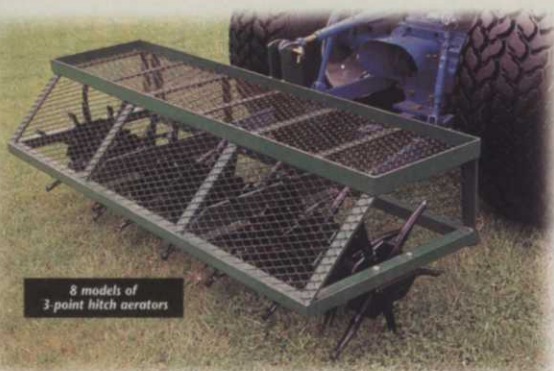
8 models of 3-point hitch aerators