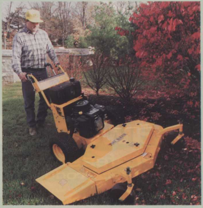
Howard Price Hydro Walk-Behind features dual hydro control levers. Floating deck system oscillates to prevent scalping.