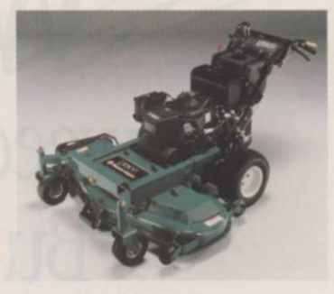
Lesco Float Deck rotary mowers tame difficult terrain.

answer. Floating deck with pneumatic caster wheels and fully articulating front axle assures precision cutting. Deck is designed for maximum air flow for even dispersion of clippings. Height adjusts on four-pin system. The 48-inch version comes with a 17-hp electric-start Kawasaki, the 54-inch with a 20-hp electric-start Kohler. Both have 5-gallon fuel tanks and true zero-turn radius.