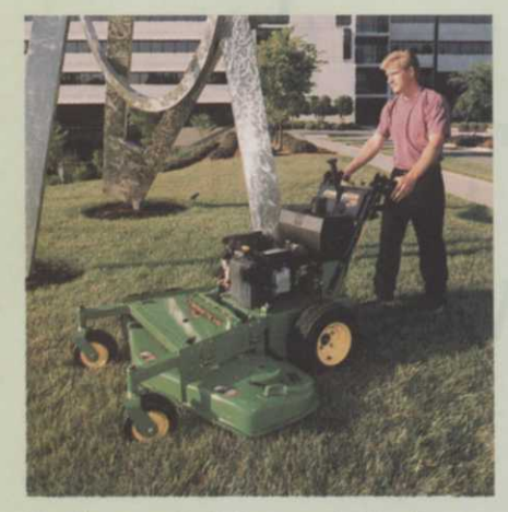
One lever controls the speed, direction, tracking of John Deere walk-behind units.

ciency, lower noise levels and cooler operating temperatures. Choose from a 36-, 48- or 54-inch deck. The larger two decks are equipped with spring-loaded quick-pull pins for fast, easy cutting height adjustment.