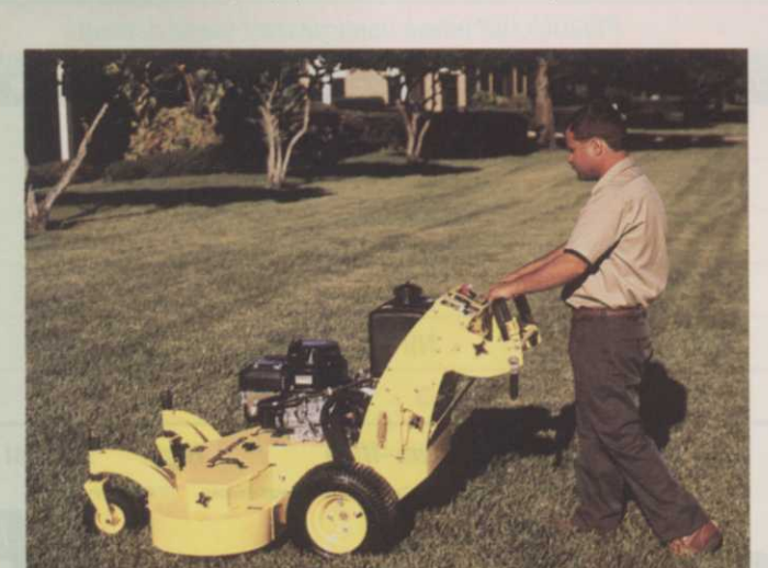
Great Dane Scamper offers 36-, 48-, 52- and 61-inch cutter decks.

For operations on difficult terrain, the Lesco 48-inch and 54-inch Float Deck rotary mowers are the