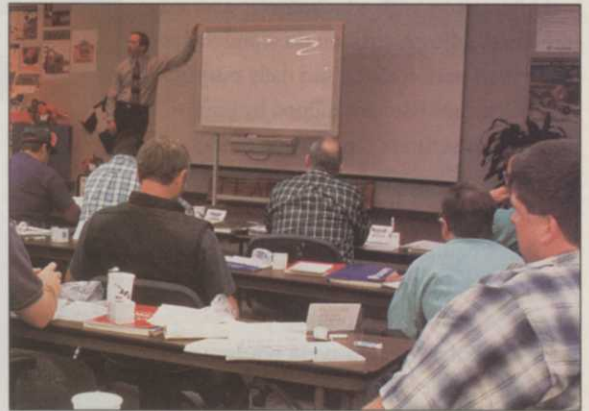
Technicians who are trained by equipment manufacturers can help you train your crew members.

The videos and companion study guides are great supplements to daily or weekly tailgate meetings, ongoing in-the-field training and competent supervision.