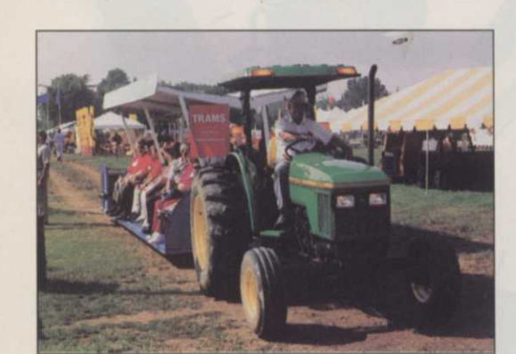
Sorry, folks, you can rest those weary feet, but you don't get a tour. You still have a lot of ground to cover if you want to see it all.

For information about attending EXPO 99, set for July 24-26, in Louisville, call toll-free 800/558-8767. From outside the U.S. or within Kentucky call 502/562-1962. Fax 502/562-1970. Internet: http://EXPO.mow.org