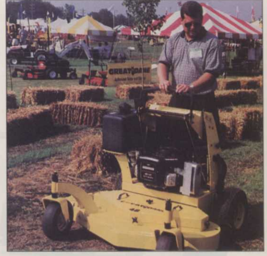
See how the equipment handles. See how shiny everything looks. Wear your shades to cut the glare.