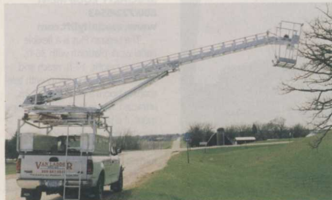
Van Ladder by Brinks Mfg. Co. Inc.'s platform supports 300 lbs.

Van Ladder's new 2921-T1 has a telescoping side reach up to 21 ft. and a working height of 35 ft. The unit has a front bumper platform from which the bucket can be loaded with tools and entered. The platform can support 300 lbs. Circle No. 262 LM