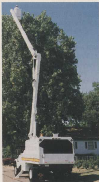
Versalift by Time Manufacturing Company has articulation of 210°.

Versalift's new VO-350/355-MH1 is an overcenter aerial device with material handling capabilities. It has a working height up to 60 ft. and horizontal reach up to 46 ft. 11 in. The product has a platform capacity