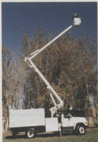
Terex-Telect Corp. Hi-Ranger has horizontal reach of 44.9 ft.

The Hi-Ranger XT-5 Series for tree trimming has a working height up to 60 ft. and horizontal reach up to 44.9 ft. Standard equipment in-