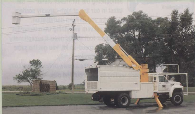
MTI Insulated Products Inc. says its MTI 55 tree trimmer has up to 60 ft. of working height. Rectangular booms give it strength.