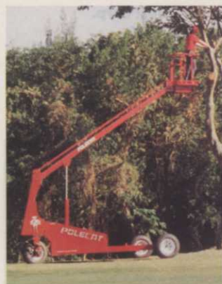
Polecat Industries Inc.

The Polecat PC266 is a self-propelled, lightweight, highway speed towable lift. It has a single, proportional joystick that provides drive/steer and raise/lower functions in one controller. An ergonomic