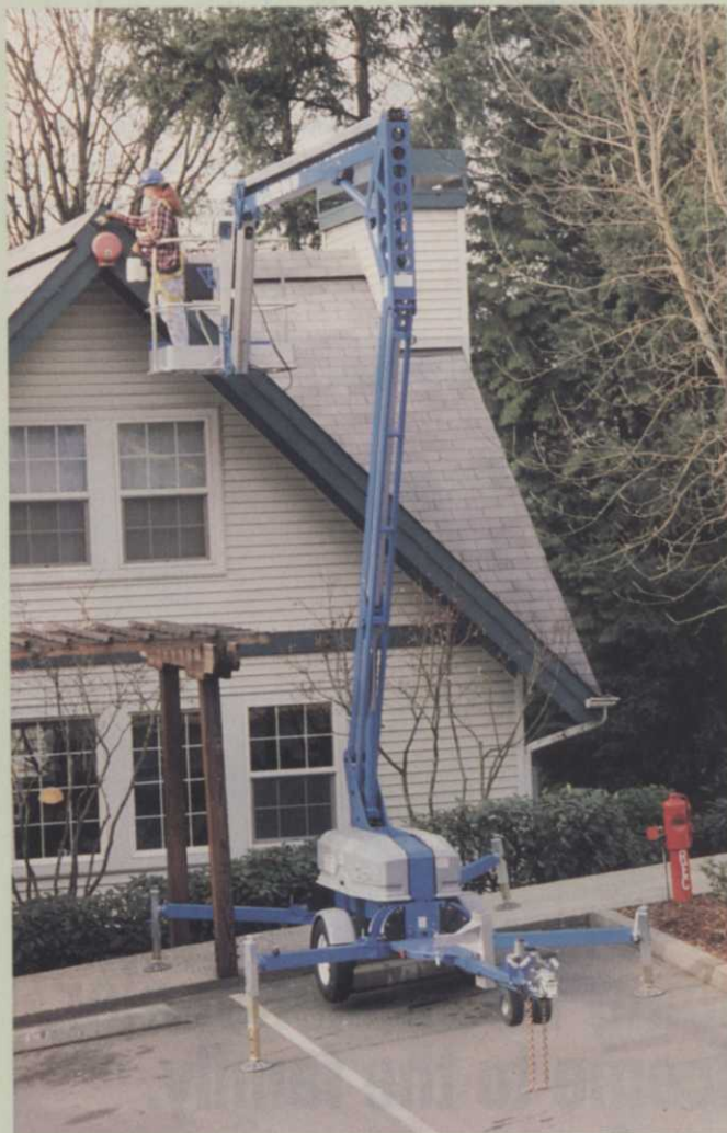
Genie Industries TMZ is based on a patented Z configuration. It has a working height of 40 ft. with a 19 ft. outreach.