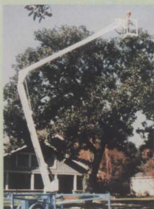
AmeriQuip's Eagle lift

The trailer-mounted Eagle lift provides 360° continuous rotation and proportional hydraulic controls