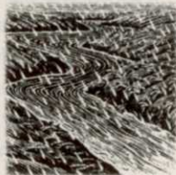
A World Without Trees

Conservation Trees conserve precious topsoil, control energy costs, and make life more enjoyable and productive.