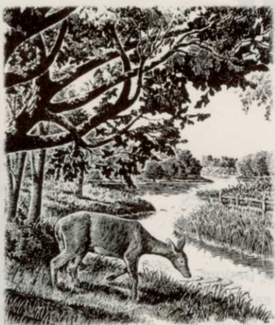
A World With Trees...with productive land, clean air and water, and habitat for wildlife

Contact Bill Smith 800-225-4569 ext. 670; 440-891-2670; Fax 440-826-2865 or Email bsmith@advanstar.com