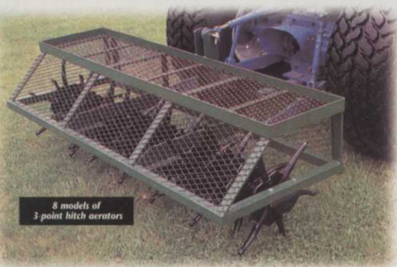
8 models of 3 point hitch aerators