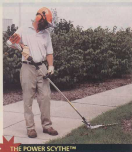
THE POWER SCYTHE™

A unique gearbox protects the FH 75 from concrete sidewalks and roadways and the blade tip is protected. In addition, the