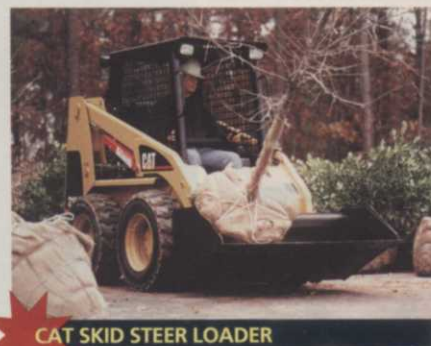
CAT SKID STEER LOADER

Six models will be available in 1999: the 216 and 226 with 1,350 and 1,500