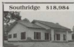
All Steel Homes