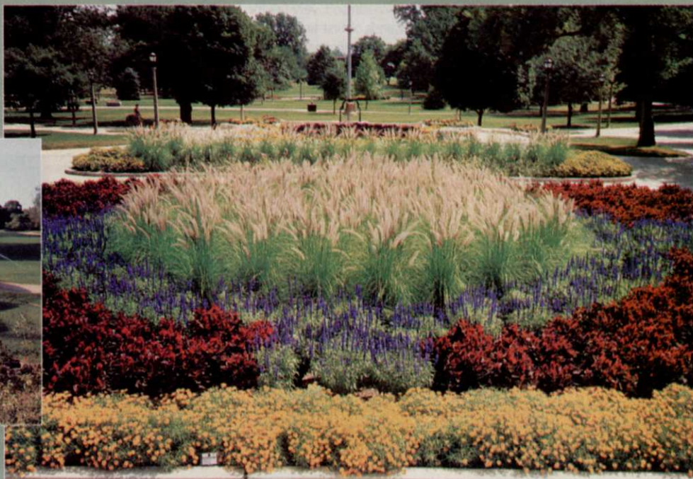
Colorful grounds surround Illinois State University