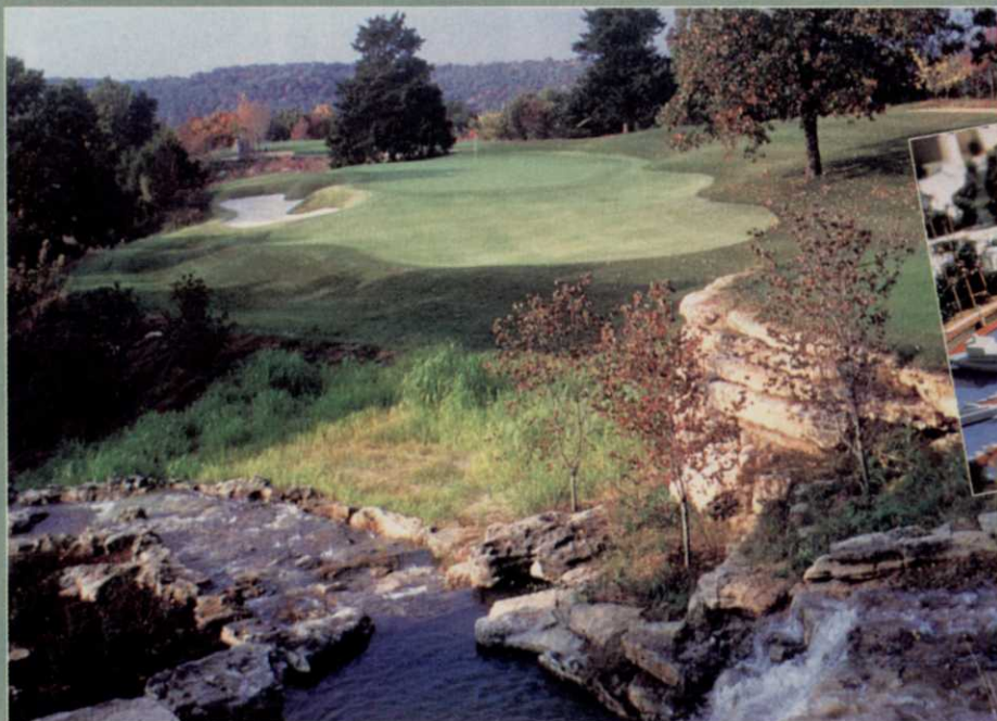
Top of the Rock designed by Jack Nicklaus.