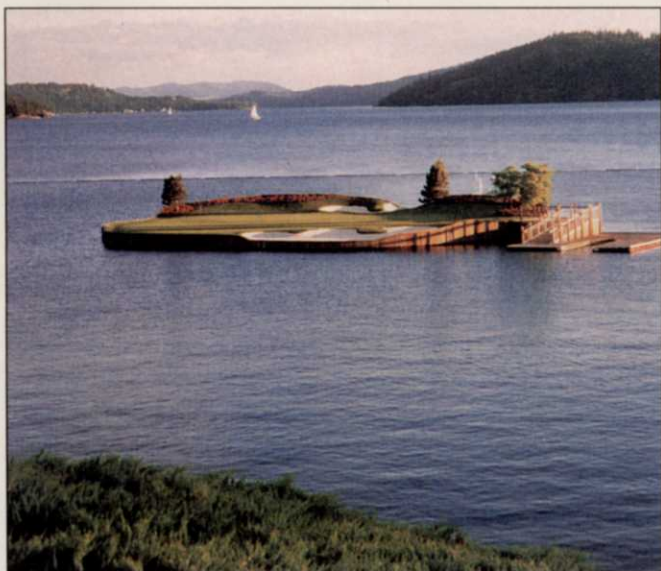
The floating green at Coeur D'Alene GC