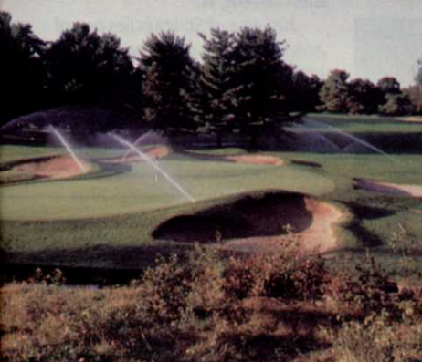
Merion GC in Ardmore, PA