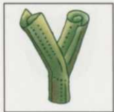
Leaf in bud: rolled