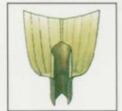
Ligule: tall with hairs