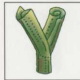
Leaf in bud: rolled