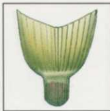
Collar: broad continuous