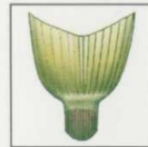
Collar: broad bottom pinched