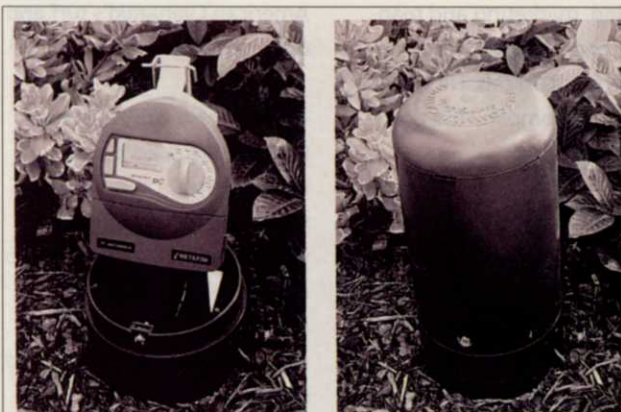
The New Netafim Miracle DC Controller in Lockable Outdoor Pedestal

Netafim Irrigation, Inc., offers three new models in its Miracle Irrigation Controller line. The models can be powered for a full irrigation season by a single 9-volt battery. Also newly available is a lockable outdoor pedestal.