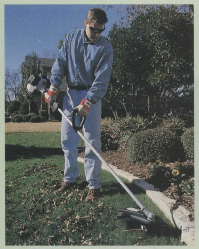
Commercial's SRM-2601 weighs just 11.5 lbs. but offers power.