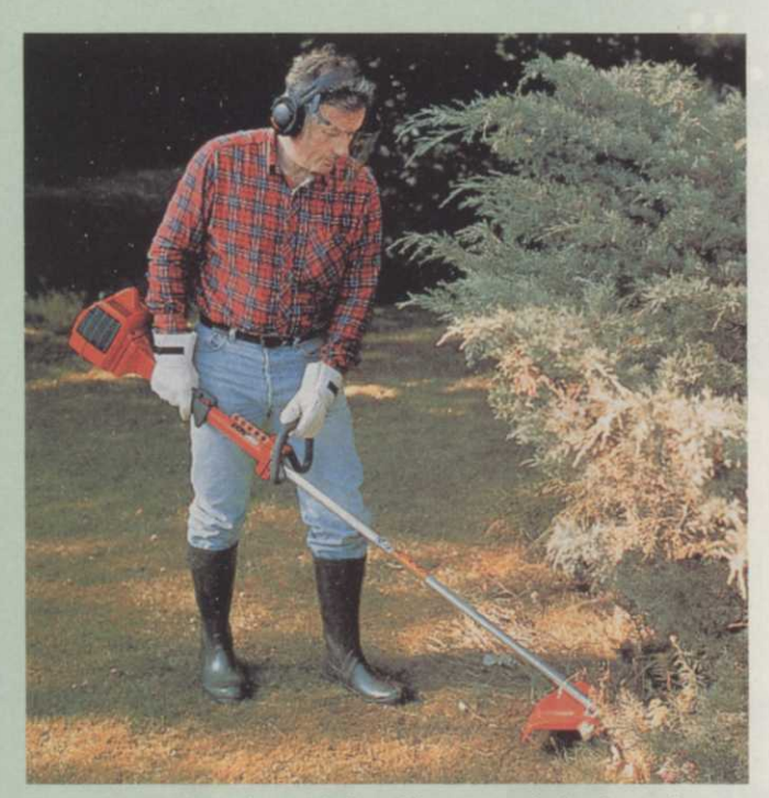
Husqvarna's 225L trimmer is less tiring to work thanks to the LowVib anti-vibration system and strong rubber dampers.