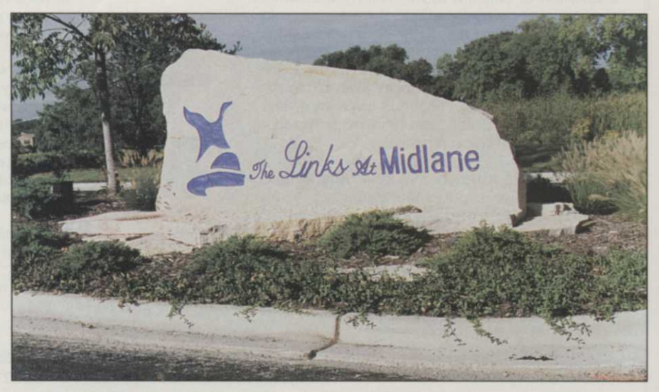
Members at Midlane Country Club get a colorful and attractive first impression as they approach the club house in anticipation of an enjoyable couple of hours of golf.

For a seed mix I like to use (by seed count) 70 percent bluegrass and 30 percent fine fescue. The bluegrass is very slow to germinate, but the fescue is up in six to eight days, stabilizing the soil. During the