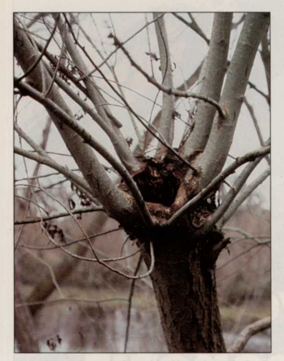
Sprouting at the end of a stubbed branch results in weakly attached branches and increased weight at the end of the branch.