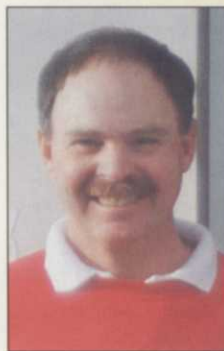
Flint: devotes energies at state level

"You have to be out there shaking hands and passing out business cards."