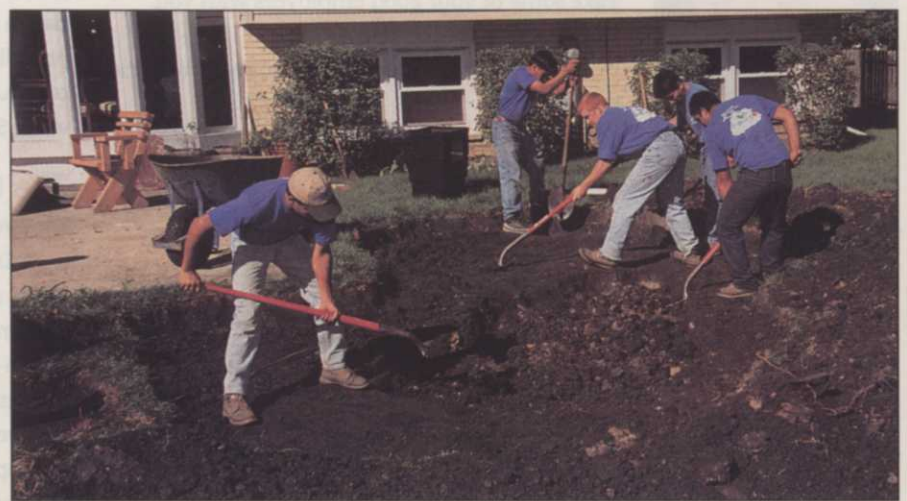
Approach constructing a pond with the idea of creating a balanced ecosystem with proper filtration, plants, and fish. It will dramatically reduce maintenance, and make customers smile.

Contractors are losing sales due to the confused customers and are spending excessive amounts of time educating themselves and their customers about water gardening. Yet, the popularity of ponds continues to rise despite all these problems. It's as if all the problems are worth the rewards to new pond owners.