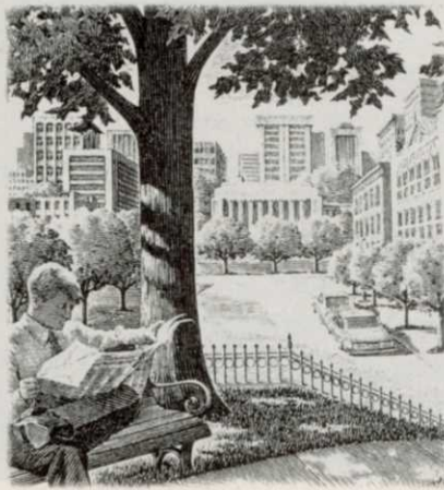
A World With Trees...where it's a pleasure to live, every day

LANDSCAPE MANAGEMENT DECK MAILS: APRIL • OCTOBER