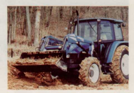
Circle No. 252

For more information contact Woods Equipment at (815) 732-2141, fax (815) 732-7580, or