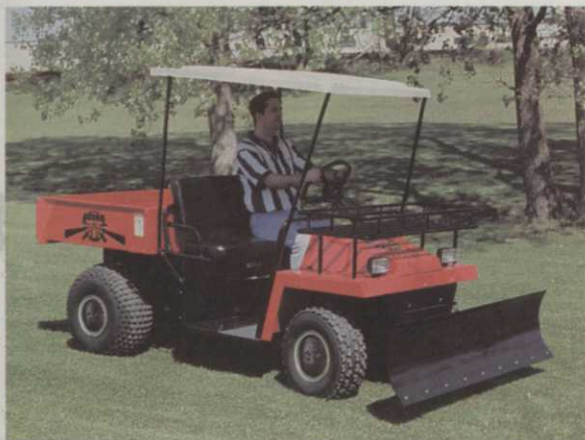
Circle No. 258

Optional features include front carrier, snow blade, canopy, hydraulic front disc brakes, turning signals and bedliner. Call Haul Master at (815) 539-9371, and tell them you read about the Huskie in LANDSCAPE MANAGEMENT , or