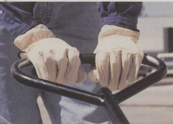
Circle No. 259

Direct Safety offers general-purpose work gloves in a variety of materials and styles for protection, durability, comfort and safety on any landscape job. It has five distribution centers for quick delivery throughout the USA. Over 6000 items in stock at most locations. For further information, contact Direct Safety at (800) 528-7405, and mention LM, or