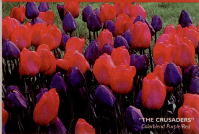
"THE CRUSADERS" Colorblend Purple/Red