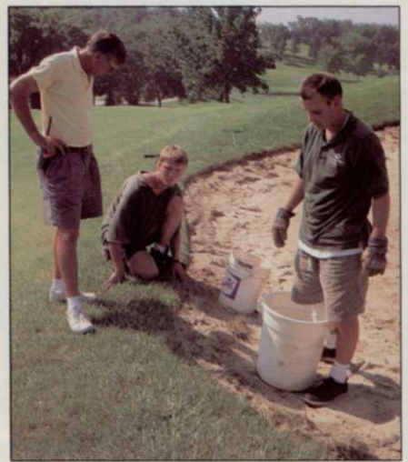
By winter's end, Smith and crew will have rebuilt many Highland Springs bunkers.

To better manage mowing the severe angles caused by sand bunkers and lake perimeters, Smith got creative. He modified a walk-behind rotary mower with a hydraulic weedeater, and mounted dual tires to keep the machine from rutting. Now the machine mows the hard-to-get 18-inch strip between a bunker and the mower. One man can mow three acres of difficult