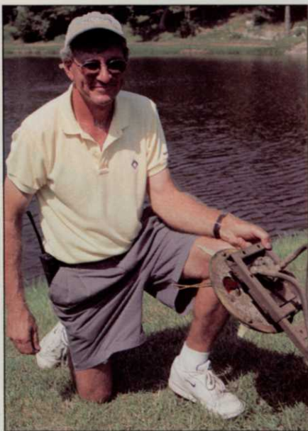
Smith's hydraulic weedeater attachment eliminates trouble when mowing around lake banks and bunkers.

Smith's solution is to remove the old sand and start over. He estimates it will take several winters to replace the sand. This time he's using a sand with a more angular particle size. It's mined from river beds near Kansas City.