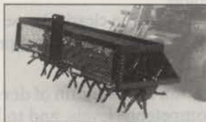
Popular Millcreek Front-Mount Aerators fit most commercial mowers

Call today, we ship your core plug aerator tomorrow.* GUARANTEED! Or you get free freight!