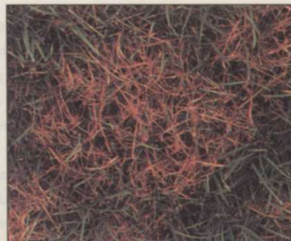
Dollar spot in Kentucky bluegrass. Note mycelium in turf.

University research reports have shown excellent control of many important turfgrass diseases including anthracnose, brown patch, red thread, snow molds, and summer patch. Heritage also has activity against Pythium blight which is unusual in a broad-spectrum fungicide. Turf managers should be aware that this fungicide, like many current products, has potential for resistance with repeated use and