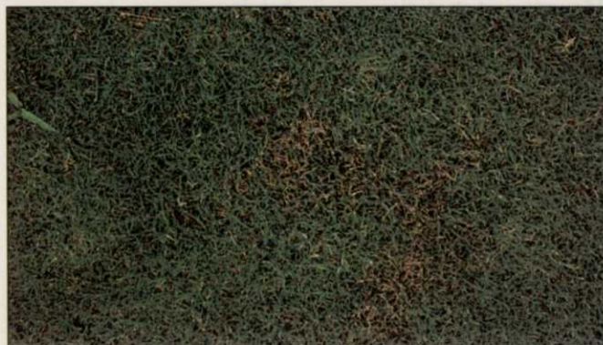
Dollar spot: most severe in hybrid bermudagrass, above, and zoysia.

The following list of turfgrass diseases outlines symptoms, environmental factors favoring disease and management strategies for the most common southern turfgrass diseases.