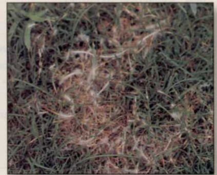
Snow mold can last in rainy spring.

Anthracnose is probably one of the most misdiagnosed turfgrass diseases. A certain diagnosis requires observation of