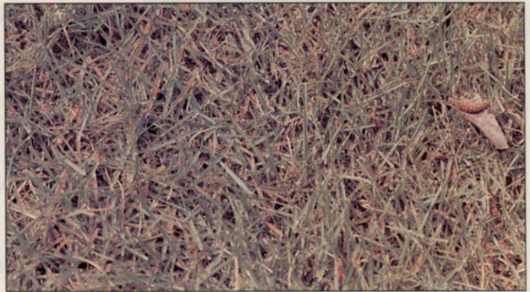
Rust in a zoysiagrass lawn. The disease thrives in under-nourished turf.