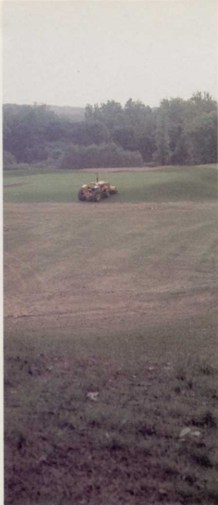
The grow-in time may vary from six months for a sprigged course in the South, to a year or more for a seeded cool-season course.